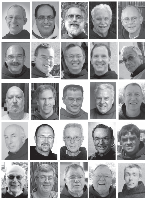
Some of the Friars who have ministered at St. Francis ...

The parishioners at St. Francis thank the Friars for 120+ years of service to our community!