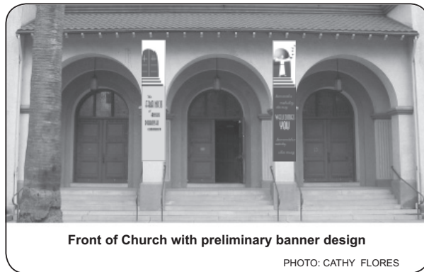
Front of Church with preliminary banner design

by the Holy Spirit. It surely looks like it, because . . . Look what they’ve given us!!!!