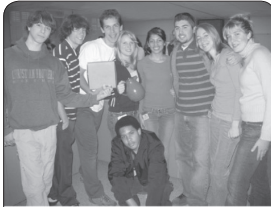
Members of the Teen Group

need. Service projects have included the #10 can food drive for Loaves and Fishes, making Christmas stockings/snack bags for the Parish Step Ministry, and the Stanford Settlement Bowling fundraiser. The Teen Group has also participated in collection projects for Grace Day home which provides low-cost day care, and for the Hmong refugees relocated to Sacramento last year.