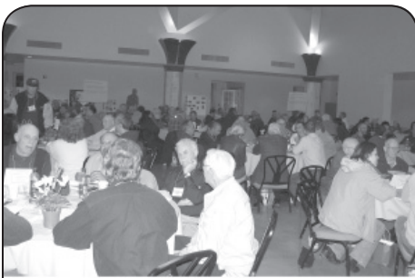
Discussions during Chapter Meeting

In a sensational move this past January, reminiscent of John XXIII's call for "Aggiornamento" which led to Vatican II, seeds were planted and windows were thrust open with vigor as the Franciscan Friars of the St. Barbara Province met for their 2006 Chapter. For the first time since the Province was formed in 1915, lay people were brought into this important meeting and, for an entire day, were given a voice previously reserved only for those who were members of this unique fraternal organization.